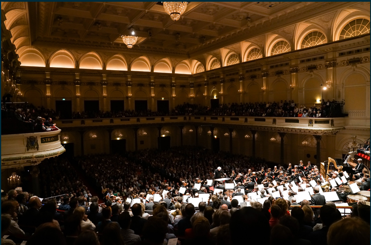
The Berlin Philharmonic in the Main Hall, 2018