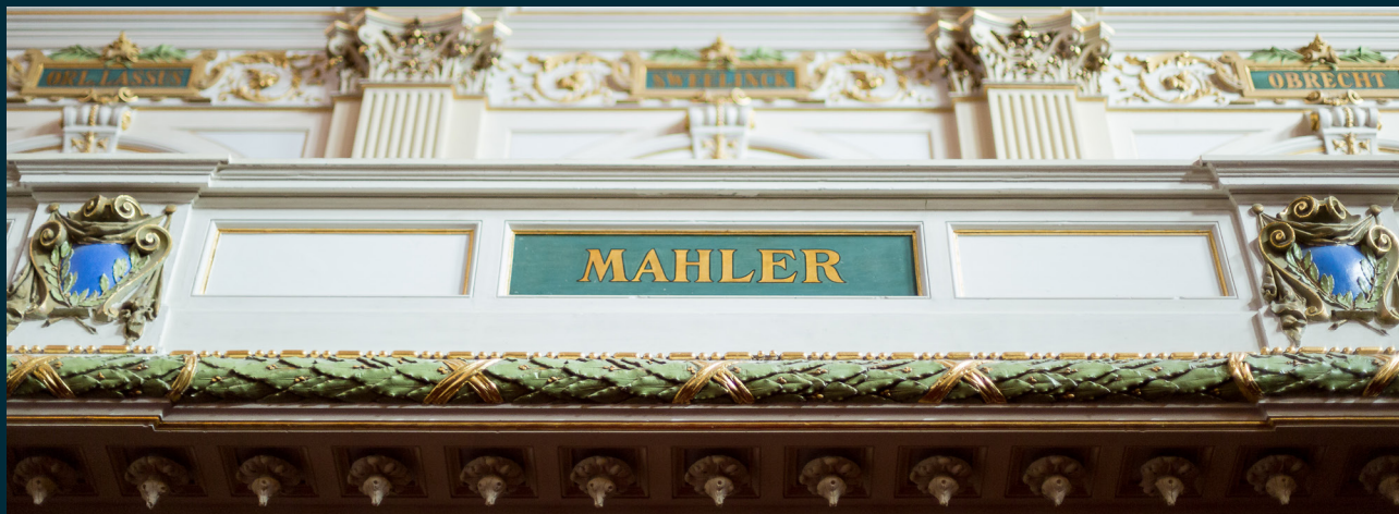
Mahler's cartouche on the balcony of The Concertgebouw's Main Hall

'In Mahler's time, although industrialisation was in full swing, there was not yet a tangible threat to nature. Nevertheless, Mahler was highly aware of the value of nature. He wrote extensively on the subject, stating that the human spirit is dependent on its environment and that if ecosystems break down, our species will vanish as well. This idea has only become more relevant in the twenty-first century, and makes Mahler's music and ideas more topical than ever.'