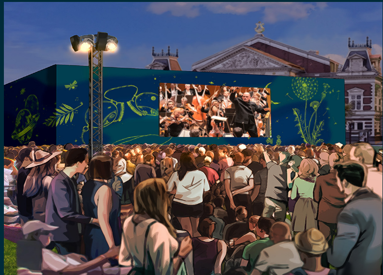
Impression of the Mahler Pavilion on Museum Square

There will be events all day in and around the Mahler Pavilion. In addition to the live streams, a variety of events will take place in the Mahler Pavilion, such as pre-concert lectures (Mahler talks), films and documentaries about Mahler (Mahler @ The Movies), lunch concerts, and lectures by authoritative speakers from different disciplines about Mahler's time (Mahlers Zeitgeist). During the first festival weekend there will be a two-day symposium on the texts that Mahler used for his symphonies and songs. Food and drink will be provided by a Mahler Café and food trucks.